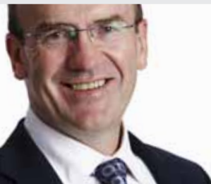
Sir Terry Leahy | Investor