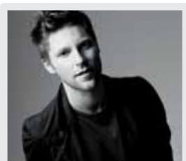
Christopher Bailey | Chief creative director Burberry